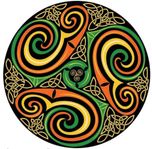
Colour in Celtic art

4... Shape, the outline of the piece, its size, edges, volume and the surface. All combine to determine how the item looks.