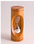
Adv: Henry East

Who were the winners 10 years ago - Feb 2008