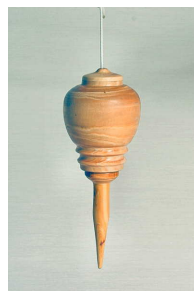
Paddy Finn - exp