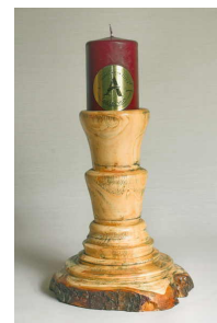
Sean Egan - beg