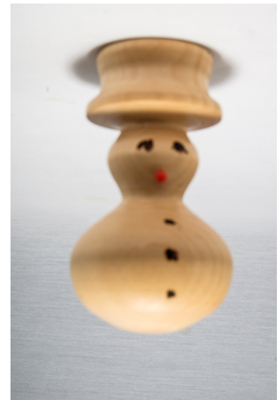
Ruth Wallace - Beg