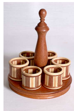
Colm Hyland - adv