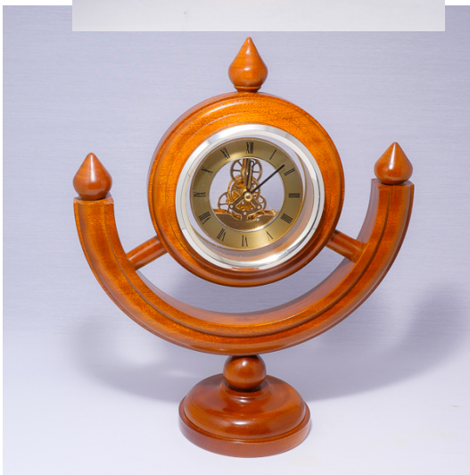
Seamus McKeefry - Adv